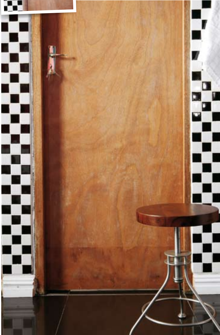
Adjustable height stool R495, Coricraft.

TIP: LOOK AT THE MAKE OF YOUR OLD LOCK AND TRY TO REPLACE IT WITH A LOCK OF THE SAME BRAND. THIS WILL MAKE INSTALLATION EASIER AS SIZES ARE UNLIKELY TO VARY AND YOU CAN USE THE SAME OPENINGS.